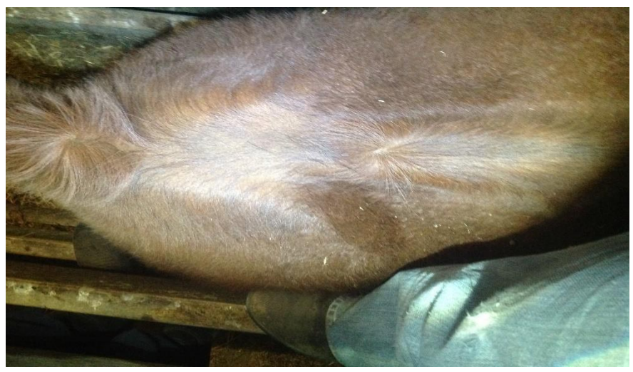
This Braham bull has his swirl 1 - 2 inches up his hump which is

This heifer shown below actually has two swirls. One on her neck and one mid-way down her spine. We go by the front one and usually it won't be any further forward than shown here.